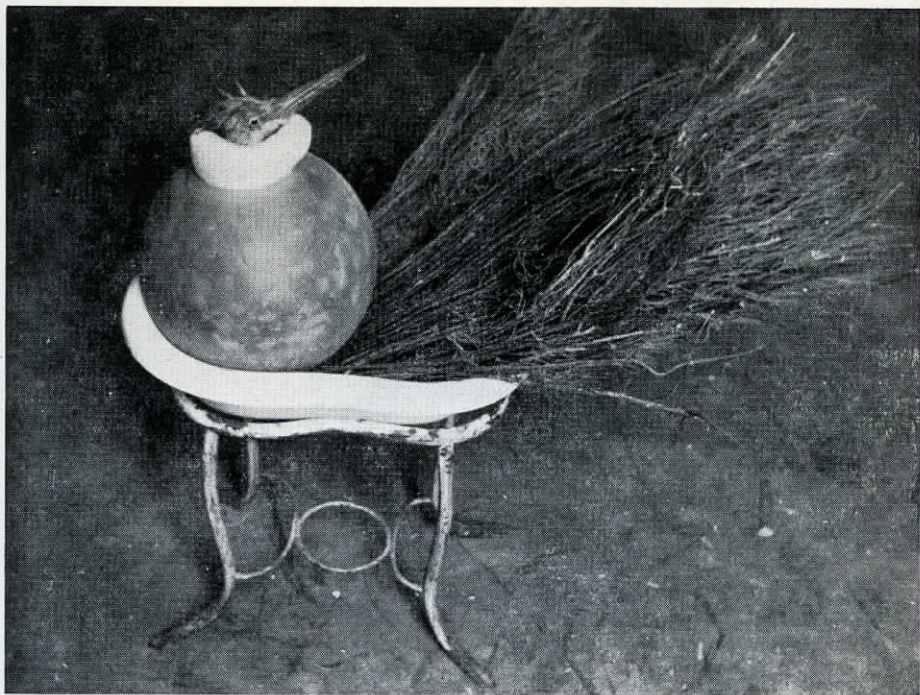
HAIRON OR AFTER GASM ONE to Barney Newman