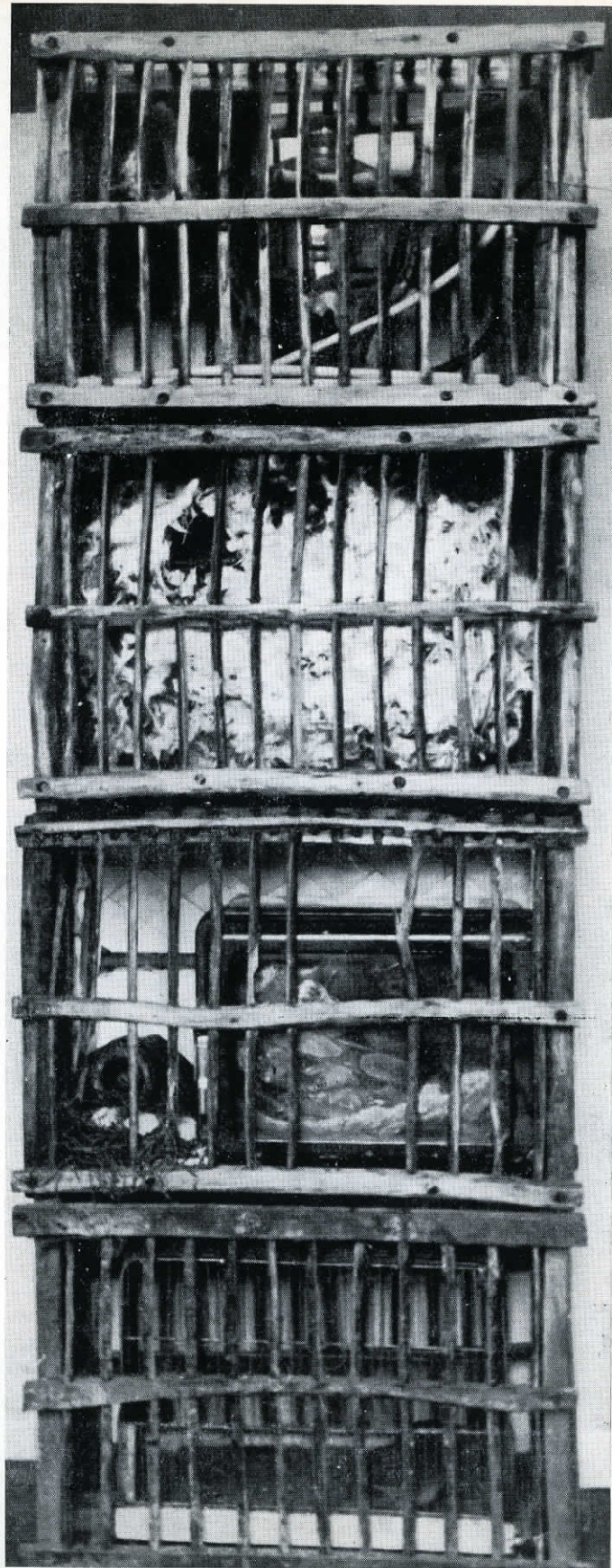
ZOO CAGE II